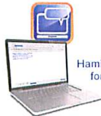
Hamilton CapTel for PC/Mac