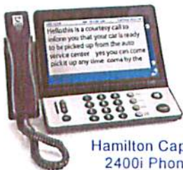
Hamilton CapTel 2400i Phone

Expand your options for receiving captions of your telephone calls through Hamilton CapTel: