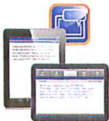
Hamilton CapTel App for Tablets